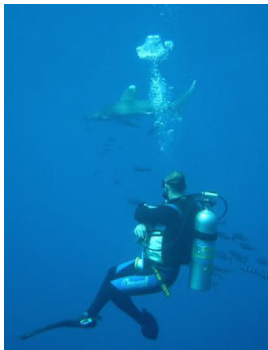
taken on Red Sea Safari 2004

Full kit hire is £15, Cylinder hire is £10 and it's only £5 if you have all your own gear.