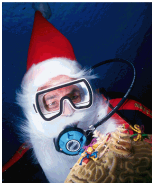
We have no idea who this is!

In case you missed this last time ... all scuba diving air fills are now free to our customers (max 2 fills per person per day).